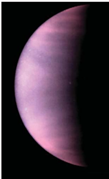
Acid skies. Could an organic pigment be absorbing ultraviolet light in Venus's sulfuric acid clouds?

Oliver Morton is a science writer in London, U.K., and the author of Mapping Mars .